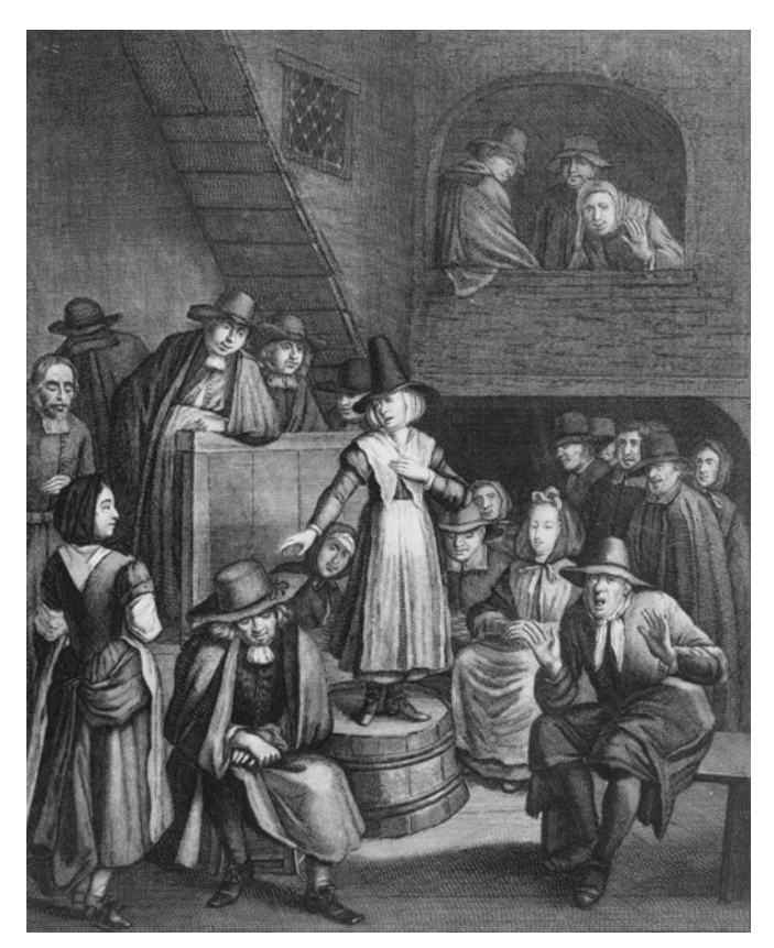
1. The scene is viewed with a hint of satire – though is it directed at the earnest speaker or at the inattentive audience? One is actually sleeping, others demonstrate disapproval.

against . . . the spirit of the Lord speaking in a woman, simply by reason of her sex . . . speak against Christ and his Church, and are of the Seed of the Serpent.'